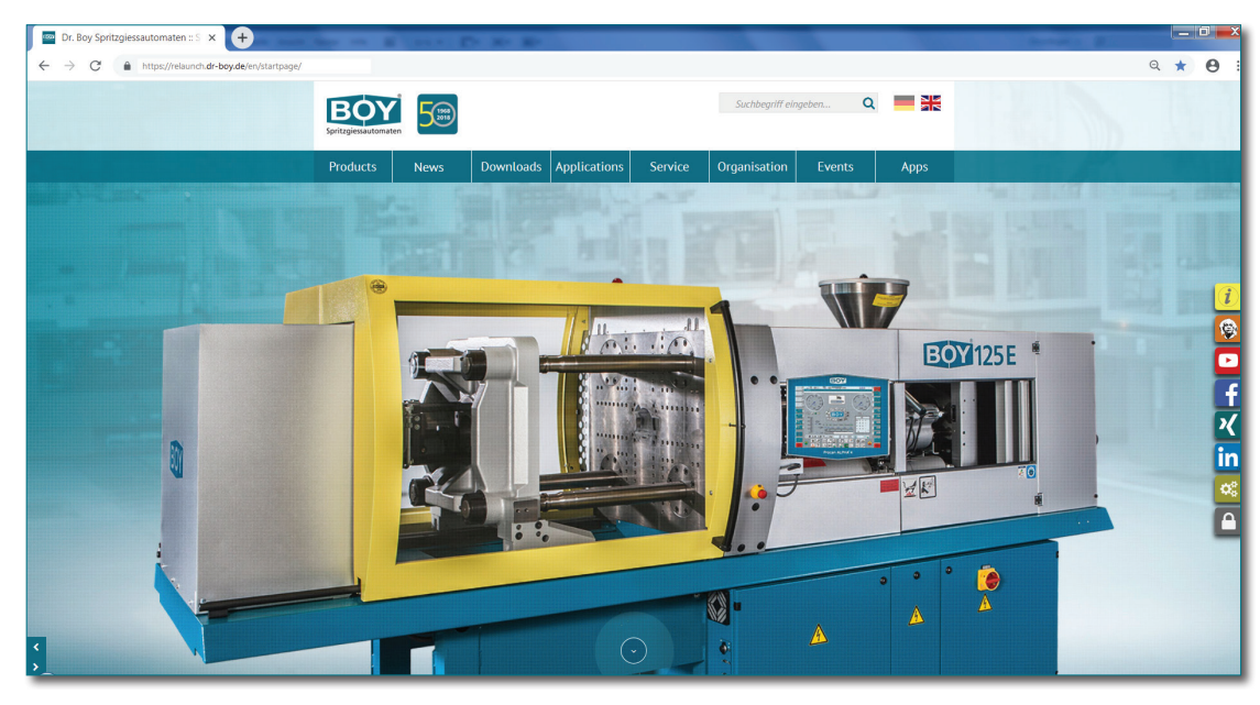
After calling up the new start page, a series of large background pictures from the BOY production, from the technical centre and successful trade fair participations will appear in chronological order.

An overview of dates for trade fairs and internal seminars as well as the log-in area for the BOY sales organisation can also be found on the right-hand side of the page.